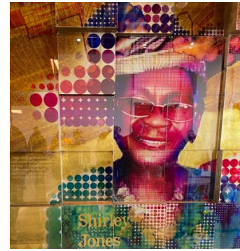
Above: Mural by Philip Hua, "Building a Better Bayview," on staircase, view of grounds from 2 nd fl., heroes of the Bayview