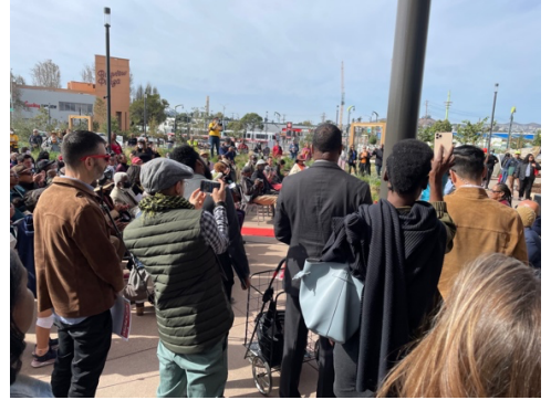
Above: Southeast Community Center Block Party, October 22, 2023, scenes from the grounds